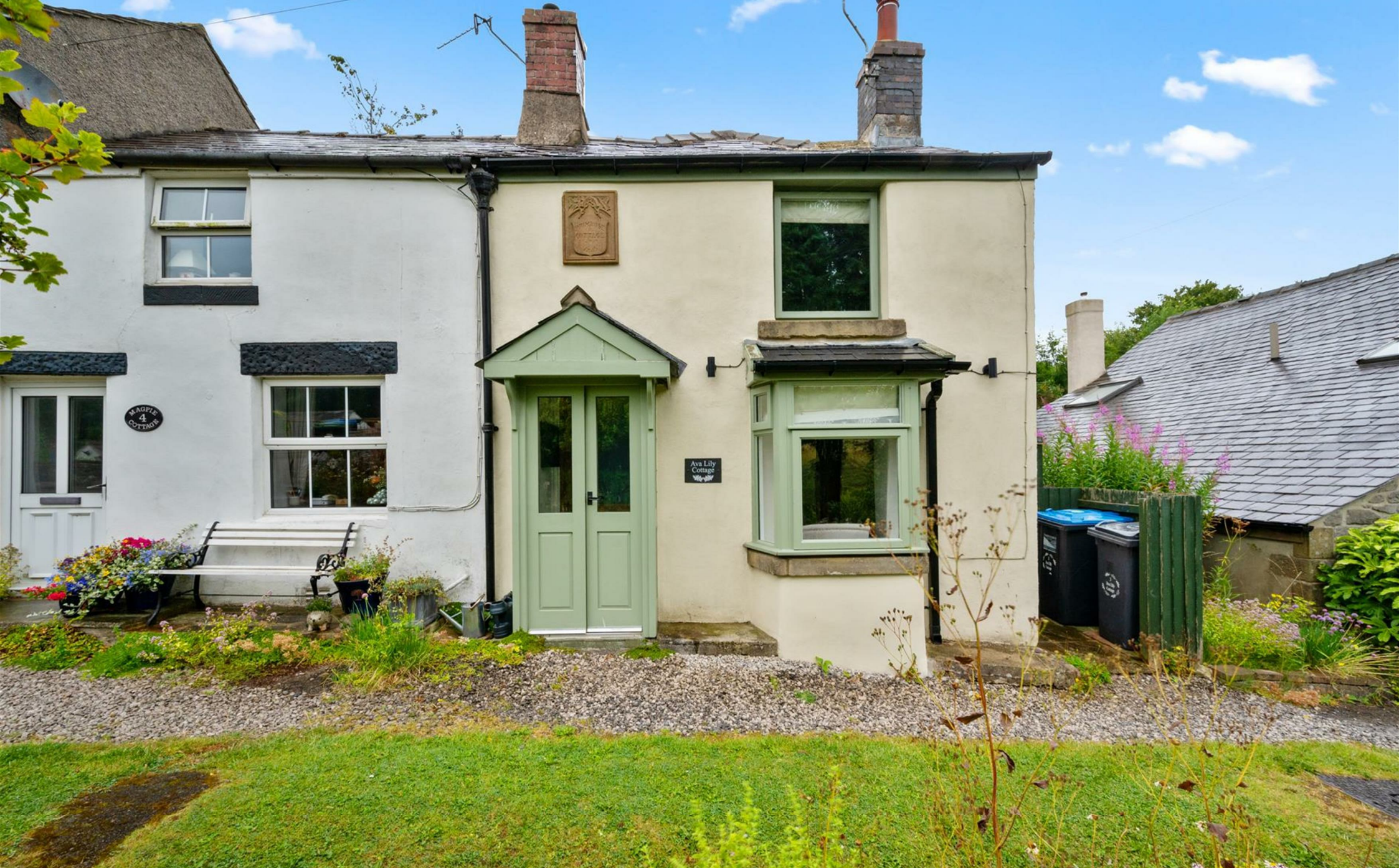
Ava Lily Cottage, Bank View, Tideswell, Derbyshire, SK17 8LU